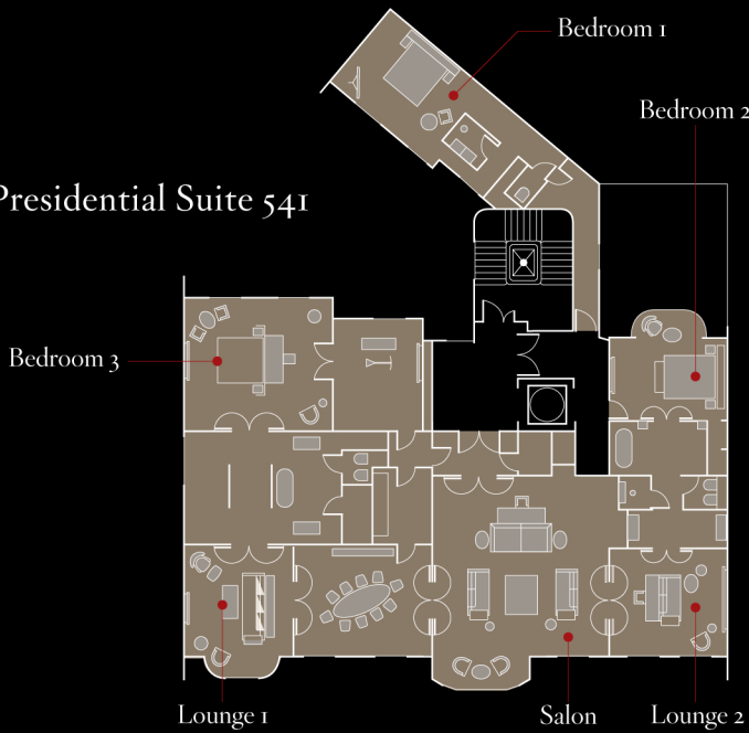
Presidential Suite 54I

Privé – at 41 Avenue Hoche – Five floors of luxurious suites individually designed by Philippe Starck with a private entrance and discreetly serviced by Le Royal Monceau, Raffles Paris.