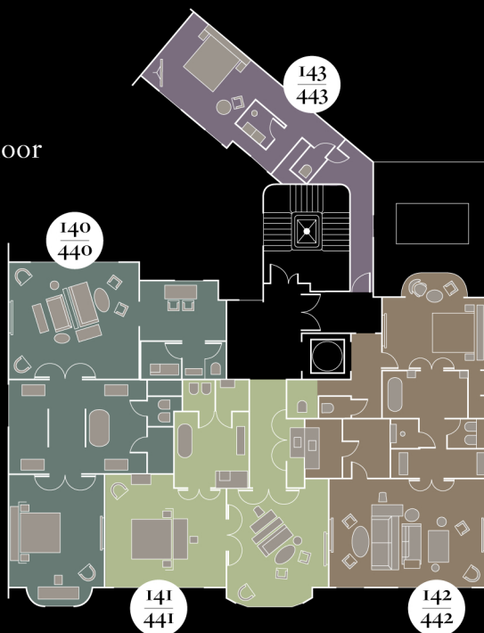
First and Fourth Floor